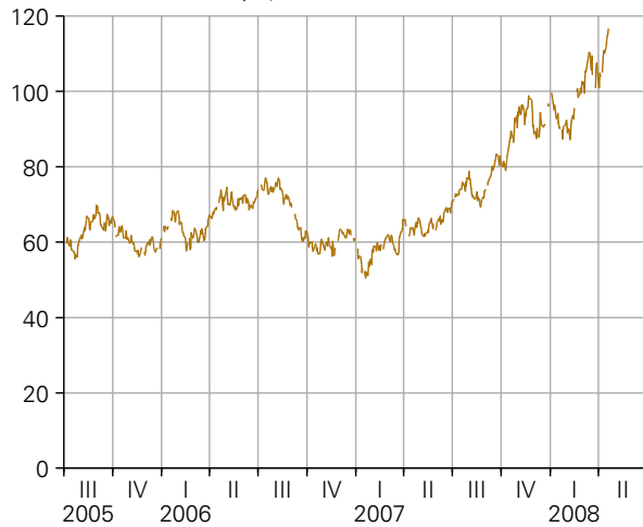
Price of Oil West Texas Int, $/bbl