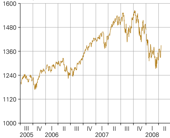
S&P 500 Stock Prices Daily Close, Index 1941-43 = 10