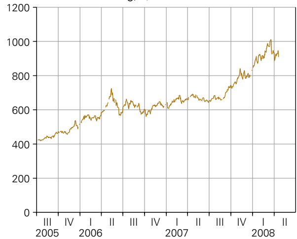
Price of Gold London PM Fixing, $/oz