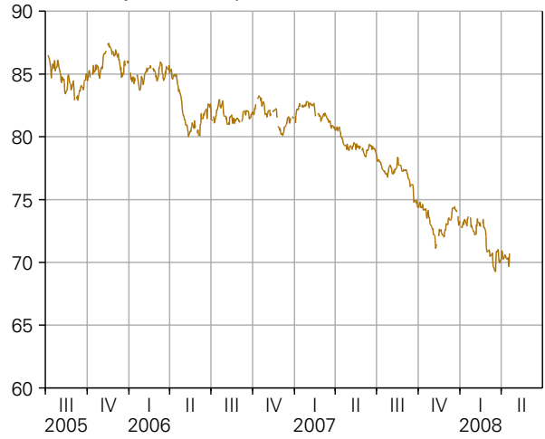
U. S. Dollar Exchange Rate FRB Major Currency Index, 1973 = 100