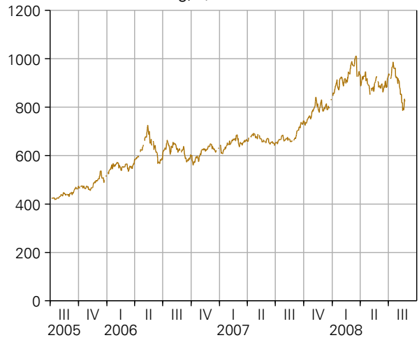
Price of Gold London PM Fixing, $/oz