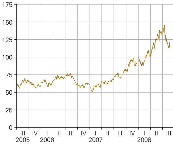
Price of Oil West Texas Int, $/bbl