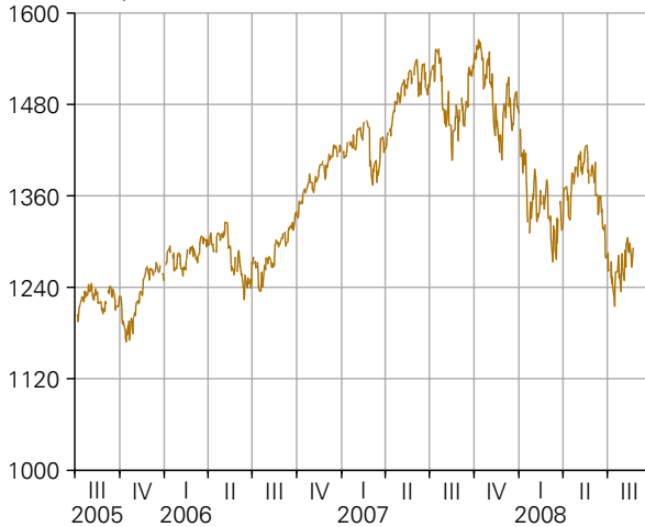
S&P 500 Stock Prices Daily Close, Index 1941-43 = 10