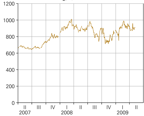
Price of Gold London PM Fixing, $/oz