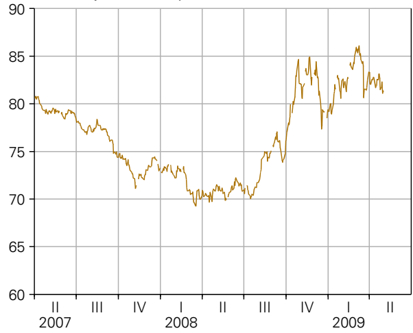
U. S. Dollar Exchange Rate FRB Major Currency Index, 1973 = 100