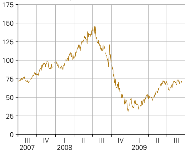
Price of Oil West Texas Int, $/bbl