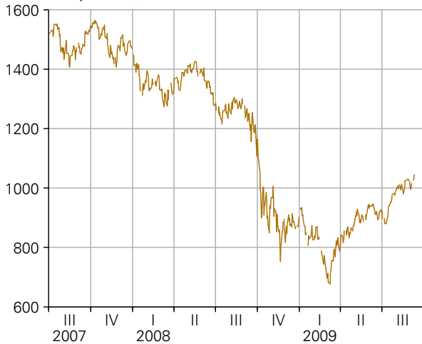
S&P 500 Stock Prices Daily Close, Index 1941-43 = 10