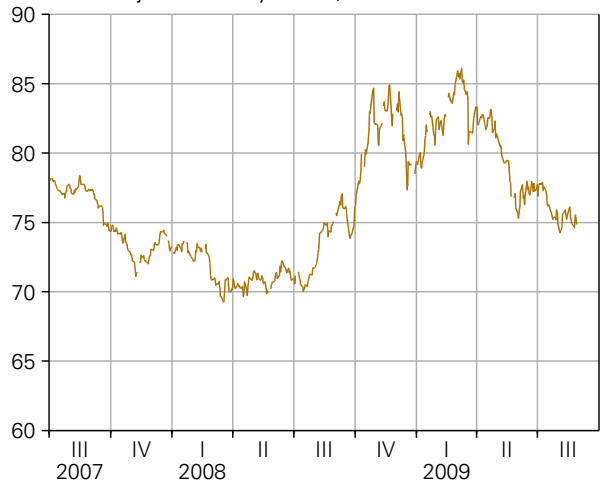
U. S. Dollar Exchange Rate FRB Major Currency Index, 1973 = 100