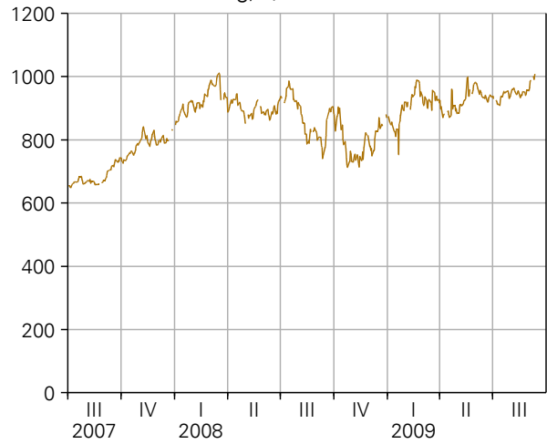
Price of Gold London PM Fixing, $/oz