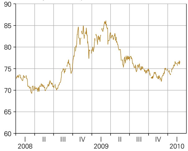
U. S. Dollar Exchange Rate FRB Major Currency Index, 1973 = 100