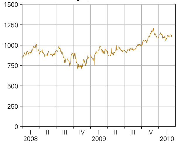
Price of Gold London PM Fixing, $/oz