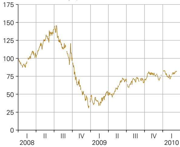
Price of Oil West Texas Int, $/bbl