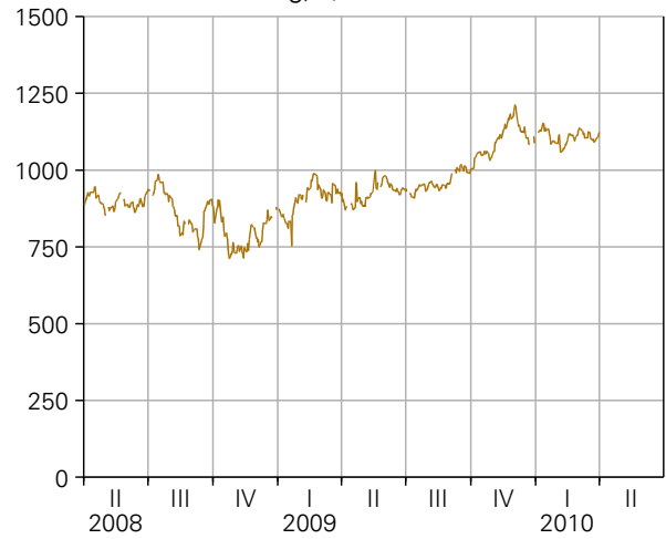
Price of Gold London PM Fixing, $/oz