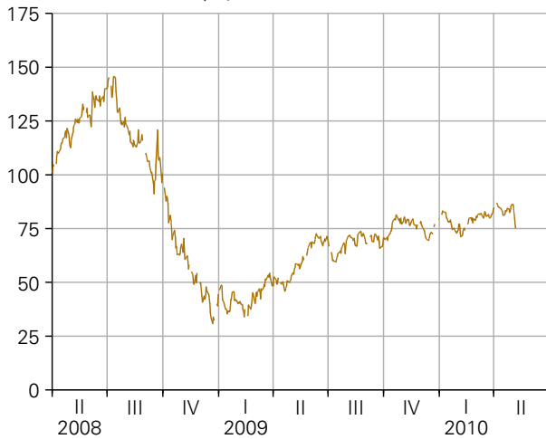
Price of Oil West Texas Int, $/bbl