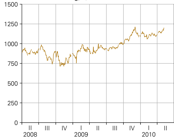
Price of Gold London PM Fixing, $/oz