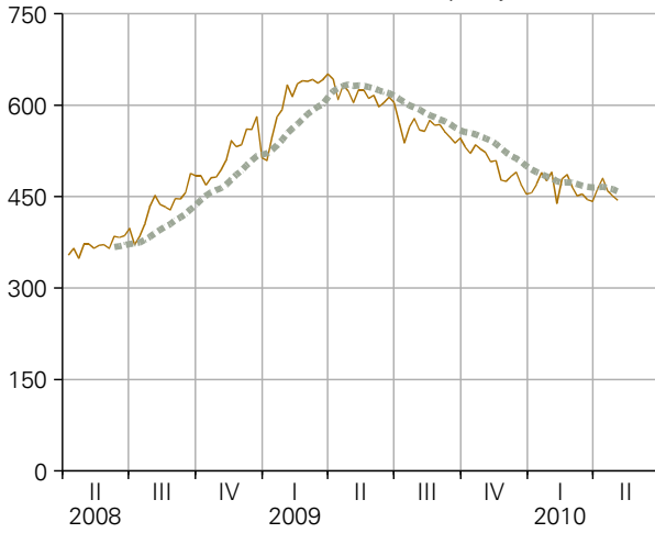
Initial Claims for Unemployment Insurance Thousands Per Week, Seasonally Adjusted