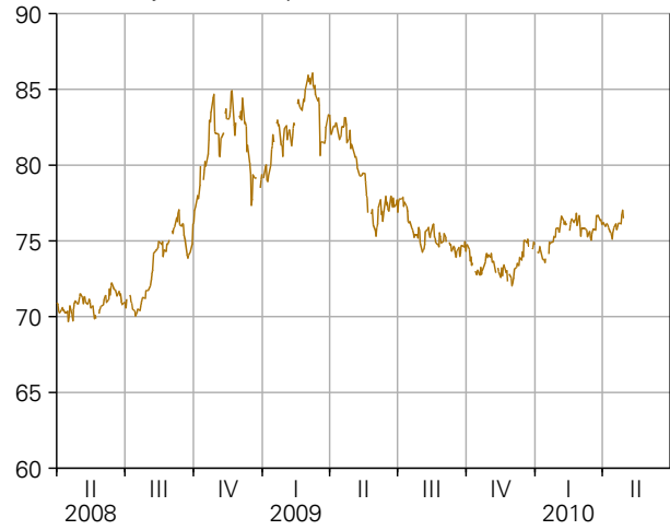
U. S. Dollar Exchange Rate FRB Major Currency Index, 1973 = 100